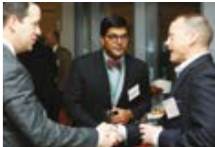
Guests from companies throughout the region attended Mercy's Corporate Partners Breakfast.

Mercy is committed to providing excellent patient care by using best practices, program innovation, and interdisciplinary collaboration. Partnerships with companies and benefactors who share our vision for advancing health care resources are of critical importance. Every gift you provide is a reflection of our mission and allows us to offer Mercy's outstanding service to all who come to our doors.